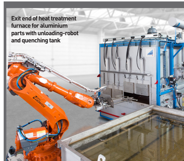
Exit end of heat treatment furnace for aluminium parts with unloading-robot and quenching tank

CONEX Die Solutions AB, a Swedish manufacturer of press dies for sheet metal forming,