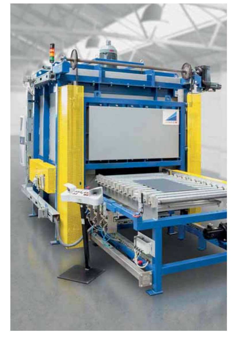
For semi-hot and hot forming of aluminum sheets, we offer you our patented application with high convection Jet Heating that has been successfully tested in our in-house Technology Center many times.

We supply you with individual heat treatment systems for heating, solution heat treating with water quenching, as well as artificial aging of aluminum forged parts or sheets, complete with loading and unloading systems, on completion of our in-house acceptance test. In this way, we shorten the commissioning time at your site.