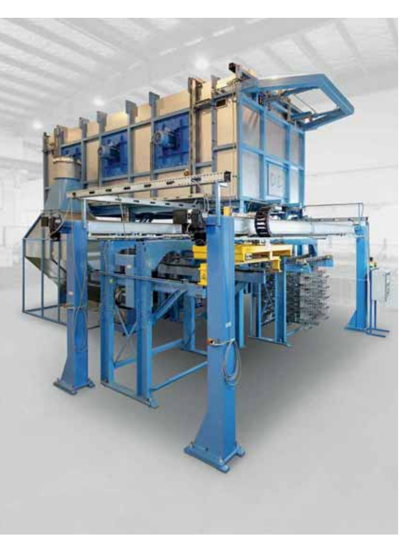
Apart from continuous conveyor furnaces, we also offer indexing pusher furnaces for artificial aging of forgings. These systems likewise provide fast and uniform heating, a quick return of parts into the processing workflow and, above all, substantially reduced space requirements.